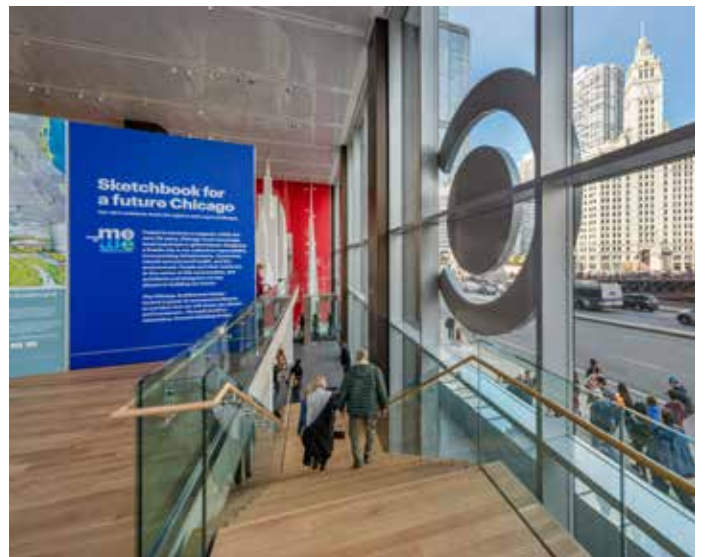
ADRIAN SMITH+GORDON GILL ARCHITECTURE