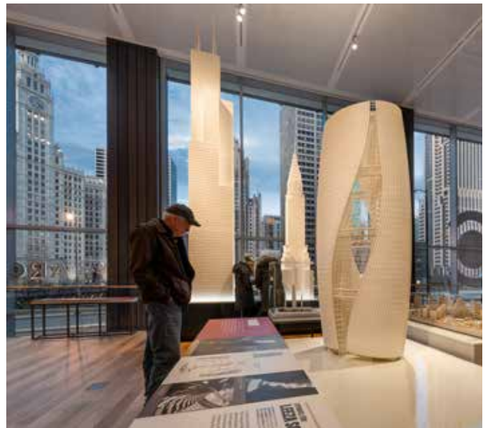
ADRIAN SMITH+GORDON GILL ARCHITECTURE