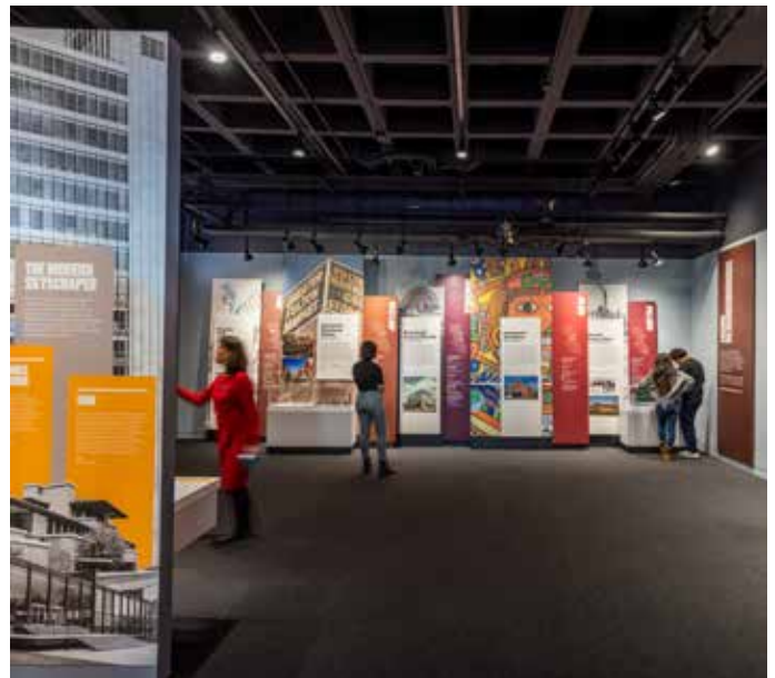
ADRIAN SMITH+GORDON GILL ARCHITECTURE